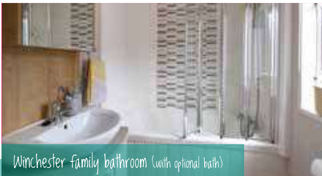
Winchester family bathroom (with optional bath)